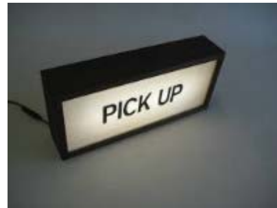
Outside Pick-Up Box

CHECK OUT OUR WEBSITE www.Lisasnaturalpath.com